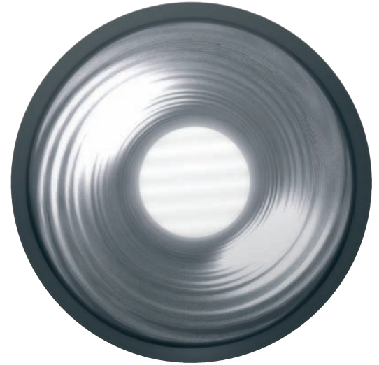
Cylinder with rippling problem

A long-standing problem in this diameter range increases with diameter size: large diameter tubes with relatively low wall thickness exhibit greater irregularities in their circular form due to cold drawing or the straightening process. Conventional skiving heads can correct these irregularities only in certain circumstances. After such a conventional machining process, spiral-shaped waves may appear along the entire length of the cylinder’s inner surface, creating a so-called rippling effect.