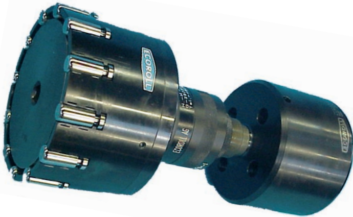
Type GZ roller burnishing tool for blind hole cylinders