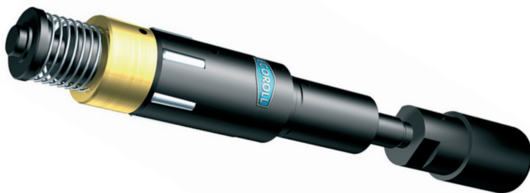
Basic Type GZ roller burnishing tool

Type GZ roller burnishing tools work together with the Type SK skiving heads to process both seamless and welded precision steel cylinders.